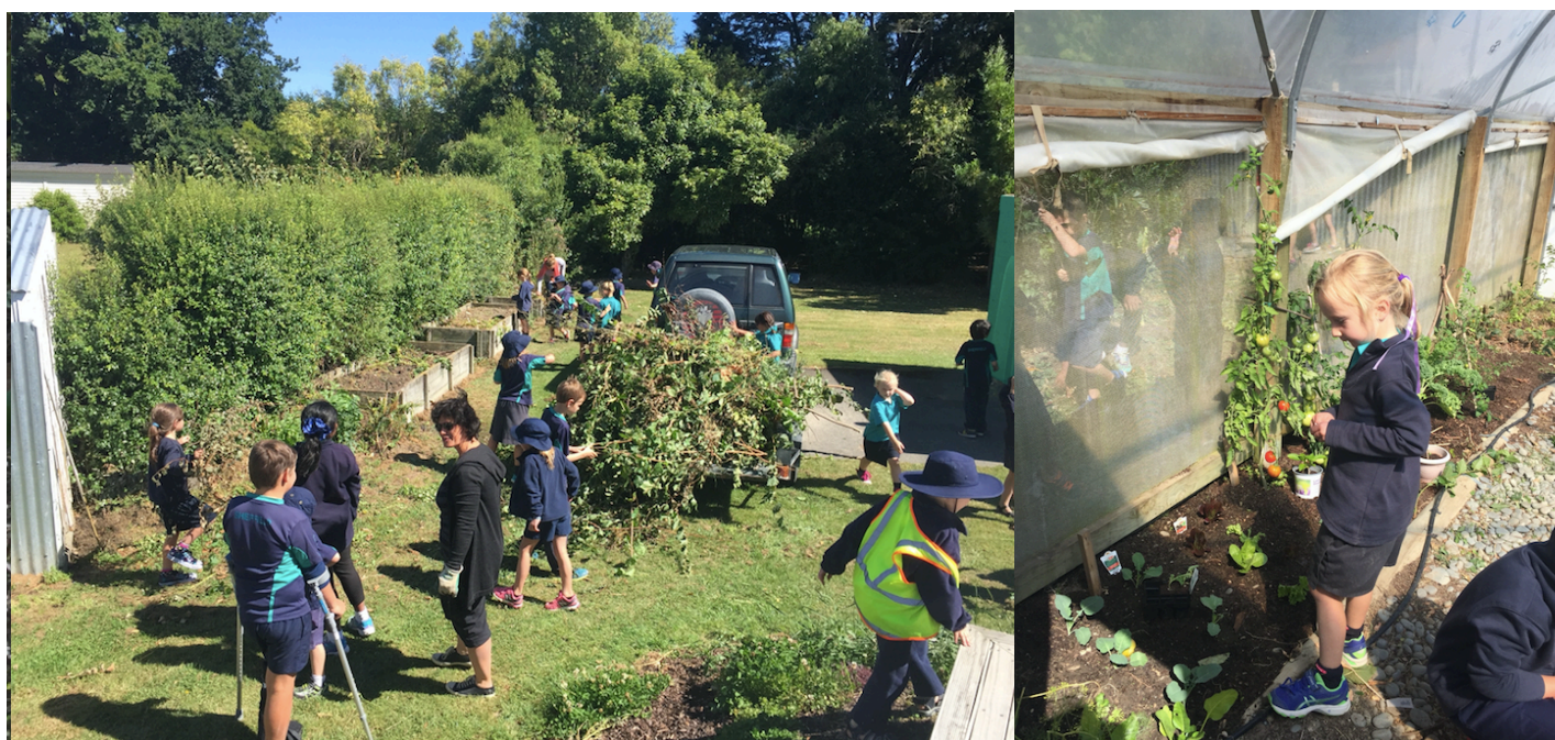
The Junior School children sorting out the planter boxes.

The Junior School Team will be planting and maintaining the school's tunnel house and planter boxes this year. Please be in touch with any of our dedicated Junior School teachers to find out if you can come and help the children plant and maintain these wonderful outdoor learning spaces.